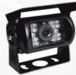
(2) Qcam 1/3" CCD Weatherproof Color Camera