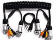
QCBC2 Trailer Hitch Kit