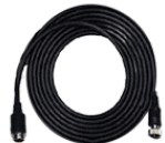
(2) QPVC 15ft Cord