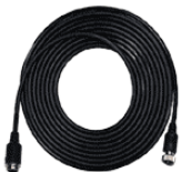
(2) QPVC 65ft Cord

Monitor Full screen is available for V1, V2, V3 and V4. Split screen is available for both V1&V2, V3&V4 Any input can be set in "rearview" mode.