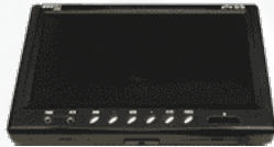
(1) Qview 9" TFT LCD Quad Color Monitor